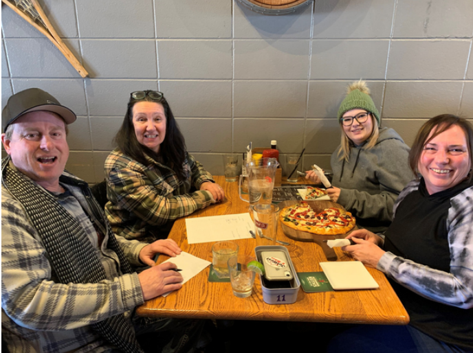
Sundre Royal Purple #191 Trivia Night

On January 15, the Sundre Royal Purple #191 hosted a Trivia Night for the local community. It was a great success, and everyone who attended had a lot of fun.