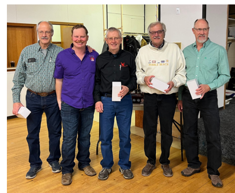
Second Place Senior Men's Stavelly #112