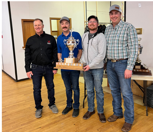
Men's Champions Barons Elks #224