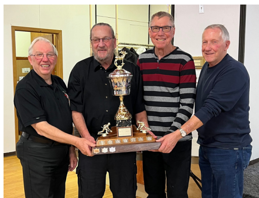
Senior Men's Champions Grande Prairie Elks Lodge #