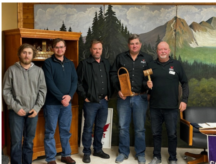
Crossfield to Olds travelling gavel.