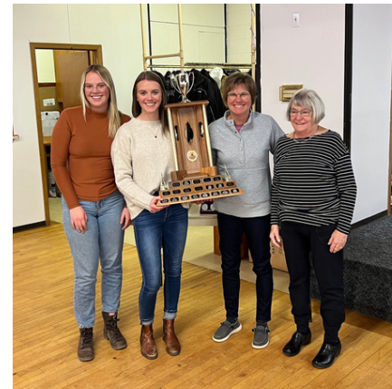
Ladies/Mixed Combined Champions from Hodgeville Royal Purple Elks Lodge #57