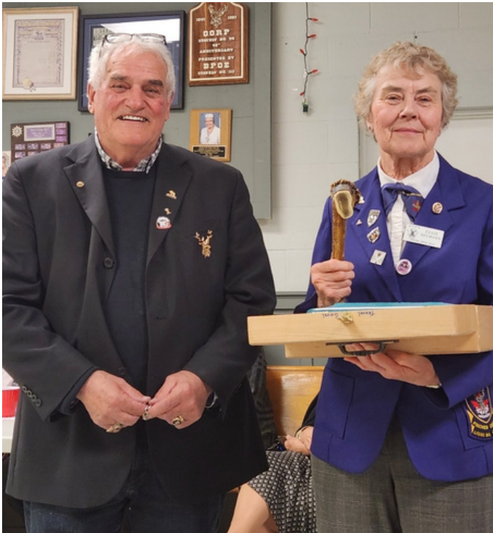
District 14 held their Spring District meeting hosted by the Stavely Royal Purple Elks. They had a great turn out, and the their Travelling Gavel arrived at the meeting completing its round of travels to lodge.