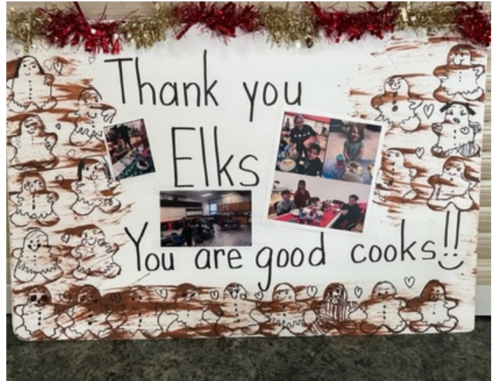
A thank you card from Avondale School Students after a January Turkey Dinner was cooked for Students from the Elks.

Note: The closest accommodations are in Drayton Valley, Rimbey or Leduc. Camping may be available at the Breton RV Park.