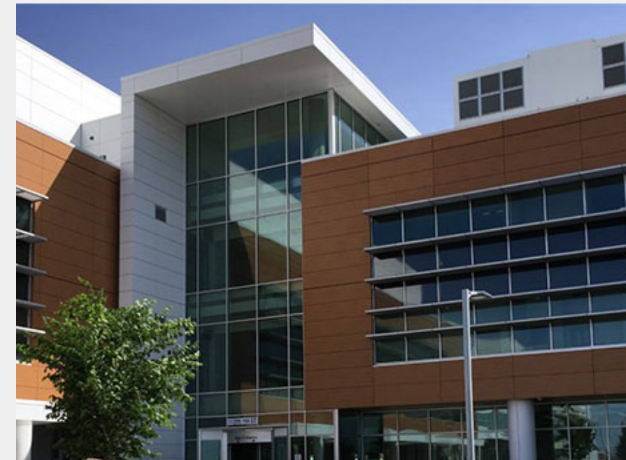
Grand Prairie Regional Hospital