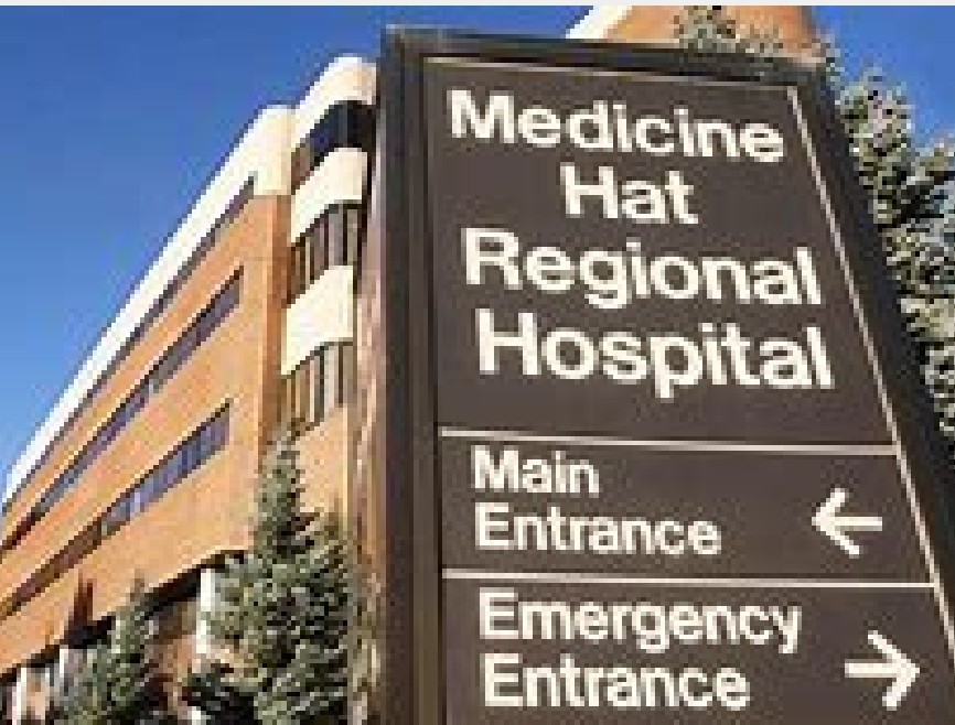
Medicine Hat Regional Hospital

Mighty Lil Elk is aimed at pediatric patients and their caregivers who have had to be urgently rushed to another city for care. This emergency trip often leaves caregivers without any immediate assistance in getting supplies such as hygiene items, cell phone chargers and food. What saves many parents in times of uncertainty are touch points. The things that feel familiar are grounding and reminds them of what awaits them at home. The Mighty Lil Elk care bags are here to provide that support to families. Bags are provided to families by Emergency Response personnel at any touch point during the family's visit to our Regional Hospitals.