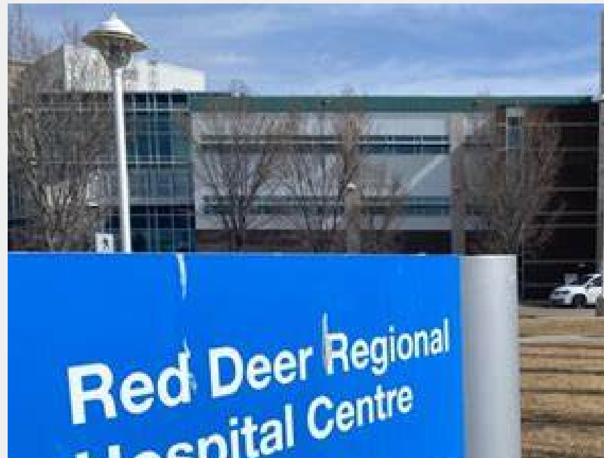
Red Deer Regional Hospital